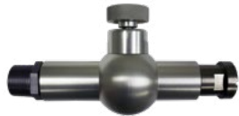
PELLET FRAGMENTER IBFN007 Shatters Dry Ice Pellets for Delicate Cleaning