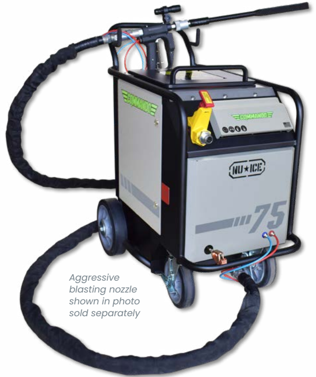
Aggressive blasting nozzle shown in photo sold separately