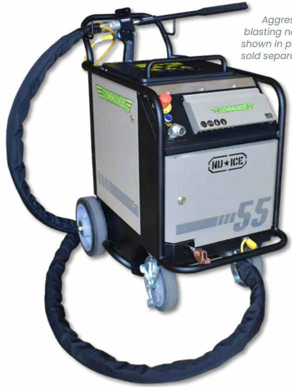
Aggressive blasting nozzle shown in photo sold separately

The COMMANDO ® 55 Dry Ice Blaster is a powerful pneumatic and electric cleaning machine built to take on even the most challenging cleaning applications. Ideal for heavy duty cleaning and commercial cleaning service applications, the COMMANDO ® 55 features a larger 55 lbs (25 kg) hopper, the BlitzFeed ® freezeless dry ice delivery system and an increased air flow capacity for maximum blasting velocity.